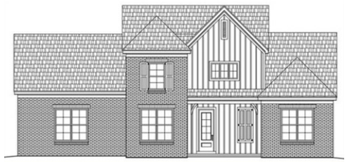
Floor Plan Model – Hazel B